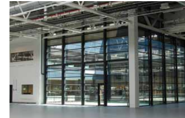
COVER Coloplast Zhuhai, China